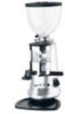
Expobar 600 Manual