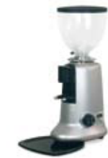
Expobar 600 Grind on Demand