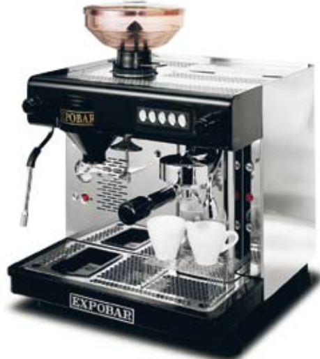
Control with grinder