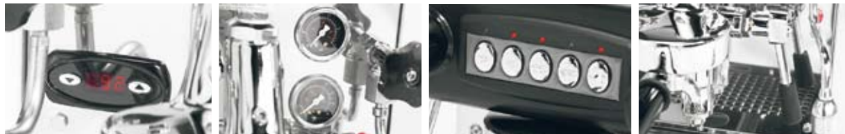
Display to adjust the temperature.

Office comes with one group head and one boiler as standard. One of the Office models, however, is available with dual boiler system: one boiler for steam, hot water and to pre-heat the water entering to the boiler. The second boiler keeps the right temperature of water for the extraction of coffee. This allows to make coffee and use steam at any time! This model comes complete with the latest generation PID sensor to guarantee a consistent brewing temperature.