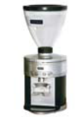
Expobar 30 Grind on Demand (available as double)