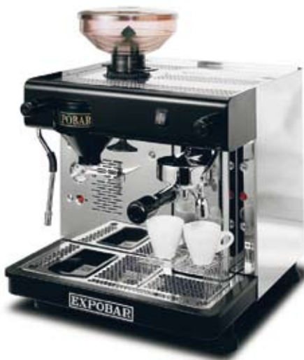
Pulser with grinder