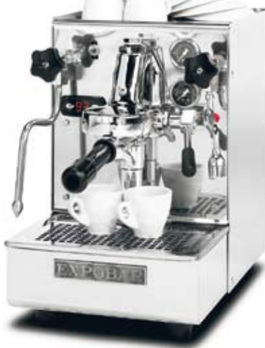
Leva EB-61, 2 Boilers