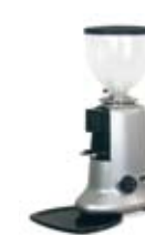
Expobar 600 Grind on Demand