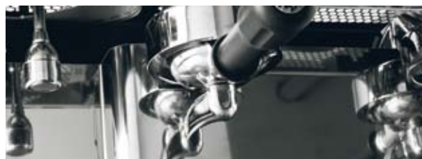
Components of the highest quality

Monroc is a two-group espresso machine with automatic water filling and a steam tank with a 11.5 litre capacity. Monroc has an electronic cup dosage in order to easily be able to pre-programme the required amount of water for various cup sizes.