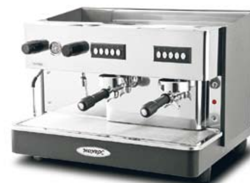
Control 2 GR