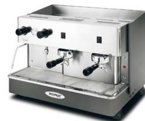
Pulser 2 GR