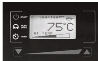
Faceplate shown in Temperature mode

Note: Induction cooking requires the use of induction compatible (i.e. magnetic) pots and pans.