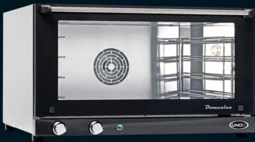
Domenica XF 043